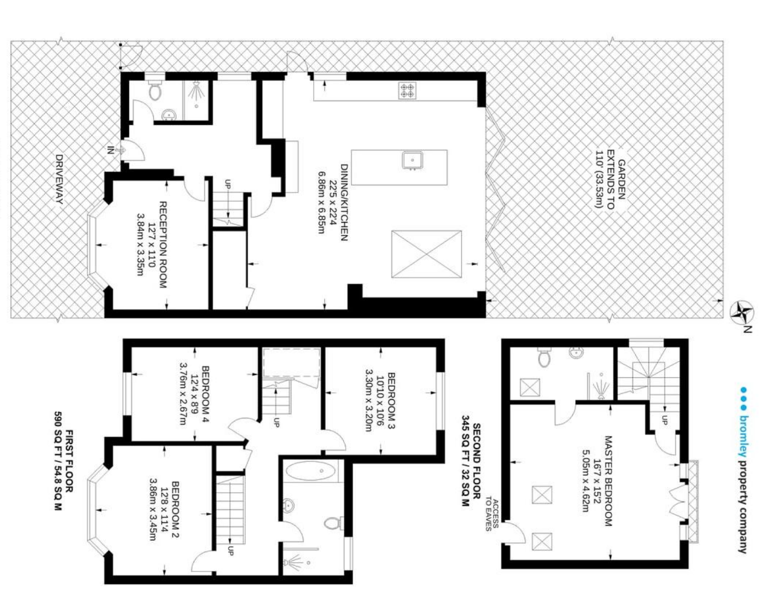
GROUND FLOOR 790 SQ FT / 73.4 SQ M